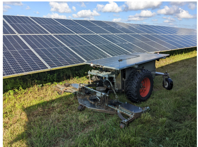
LCR with 8' mower deck managing the vegetation on a solar farm

"Having a wide field of view is extremely important because each robot only needs two cameras to operate in all types of topographies and climate zones, including open areas and challenging structured areas," Abramson explains.