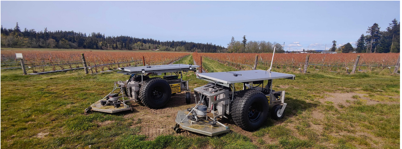
LCRs working cooperatively in a blueberry farm